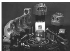
Superior's Range of PMA Parts

So even if you are unaware of any problems with your core, you could end up with a very nasty surprise in the way of a large bill.