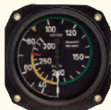
Well Respected Brand

We're very excited to announce our appointment as distributors for the superb range of Winter aircraft instruments. Winter, based in Germany, have been manufacturing high quality instrumentation for over 50 years.