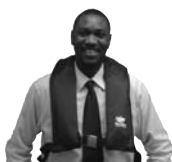
Absolutely Ideal for Sport Pilots

You'll be aware I'm sure that flight-crew in a light aircraft that's flying over water should be "wearing" a lifejacket, rather than relying on a passenger type that they're unlikely to have time to put on in an emergency.