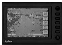
The Skymap IIIC

A number of overdue policy changes in the stunningly complex and bizarre Skyforce Avionics pricing structure means that Adams can at last offer our trade accounts huge savings on the superb Skymap IIIC moving map.